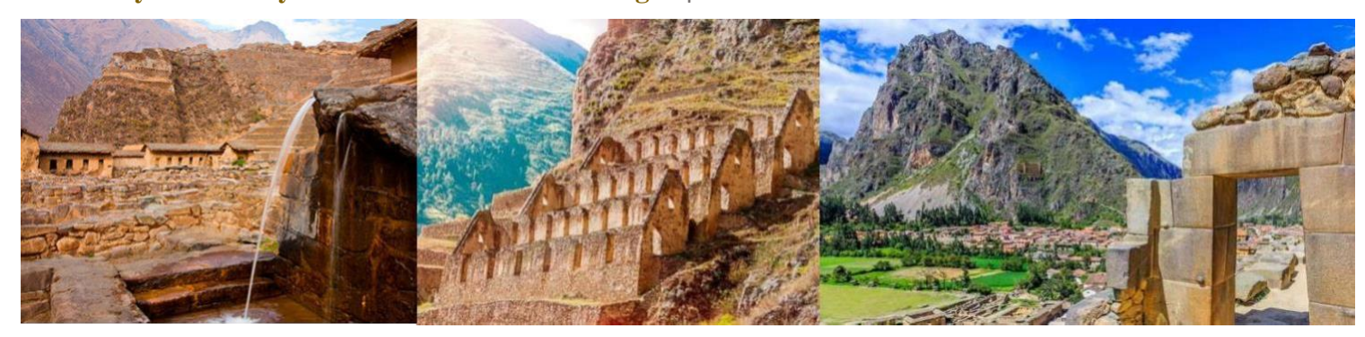
Day 2: Ollantaytambo Fortress of Knowledge April 24th

Today we will be having an early start after breakfast to head to Ollantaytambo. Ollantaytambo is known as the 'Living Inca City'. Its inhabitants maintain some of the traditions inherited by their Inca ancestors. Ollantaytambo, the spectacular Incan fortress above the villages. Here we will have the opportunity to be at the Inti Huatana, a very important sun temple located at the top of Ollantaytambo. Ollantaytambo provides a very strong energetic vortex for manifestation.