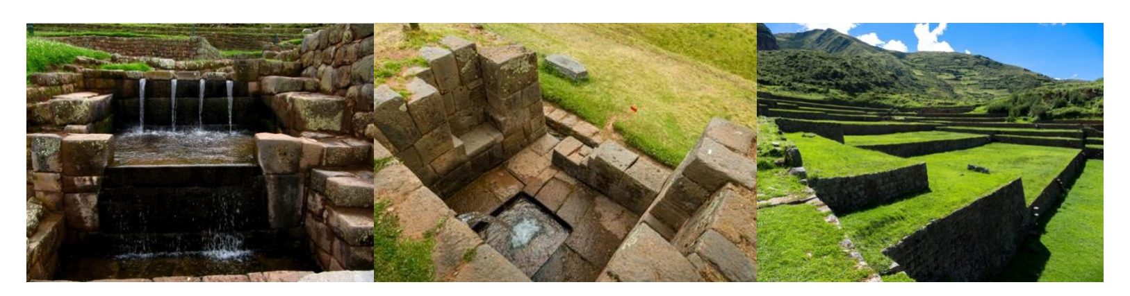
Day 9: Tipon Closing Ceremony and Integration May 1st

After breakfast in the morning hours we will head to Tipon, Located to the east of Cusco, the Temple of the Sacred waters that is still functioning and continues watering crops to this day! Here we will have a closing ceremony and integration after receiving the gifts of this land, our guides, and sacred Plant Medicines that were a part of our journey will have time to explore on our own, afterwards we will return to the city of Cusco for your departure in the evening.