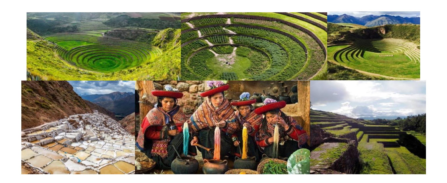
Day 5: Willoq (Ayni Reciprocity Service) - Moray April 27<sup>th</sup>

Today after breakfast we will board the train to head back to Cusco to visit Moray. Here in Moray there is an enormous Pre-Incan circular and semi-circular agricultural terraces. The Incas used them as a botanical laboratory for experimenting on plant domestication and acclimatization as well a ceremonial site that was used for many rituals.