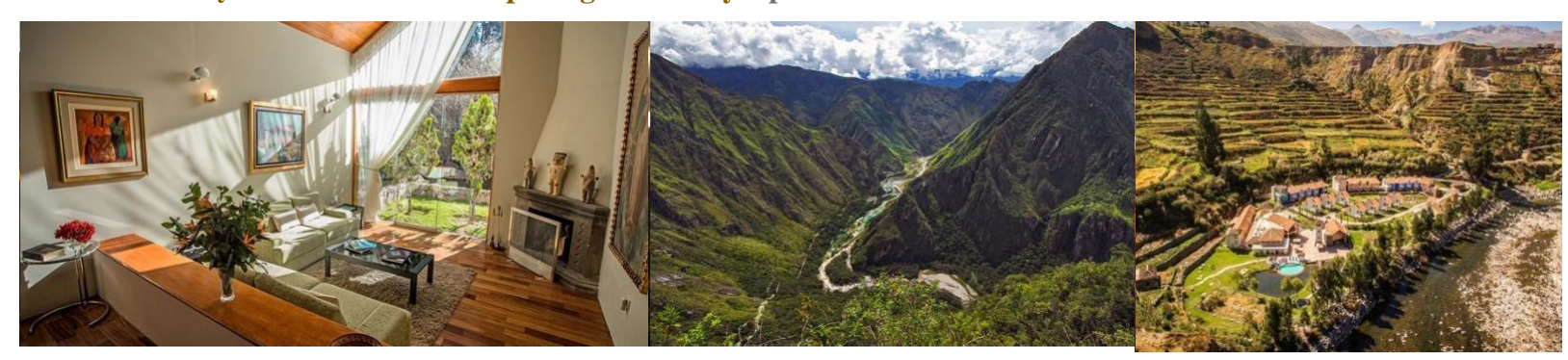
Day: 1 Arrival in Cusco Opening Ceremony April 23rd

Upon your arrival on this transforming Plant Medicine Retreat, we will have our first ceremony with Pachamama (Mother Earth) to request permission for the pilgrimage of healing and transformation we are about to embark upon. We will make our way to the Sacred Valley of the Inkas where we will all partake in an important welcoming ceremony.