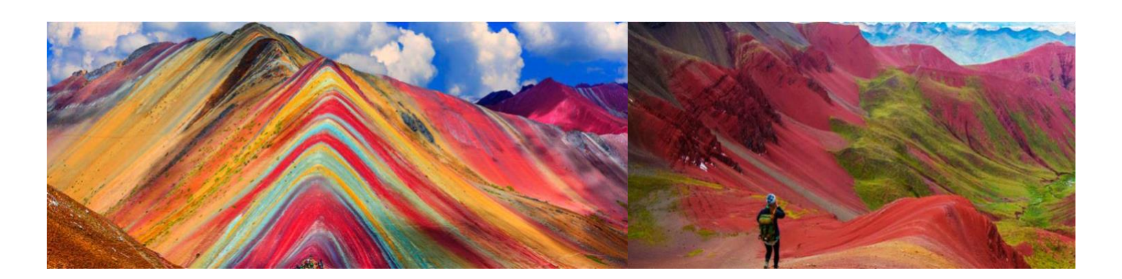
Day 6: Rainbow Mountain April 28th

Today we will be raising early to depart the hotel at 5:00 AM for this exciting adventure. The drive takes around 3 hours to get Hanchipacha community where we are going to stop for breakfast. We are then going to drive you 15 minutes to Quesiuno community (4,326 m / 14,189 ft.), where we are going to start with the hike of about 1 hour to the beautiful rainbow mountain (most of the way is going up you can go by horse if you wish at an addition cost not included ). On the way up we are going to enjoy amazing landscapes of herds of alpacas and llamas, the Ausangate Mountain and so much more.