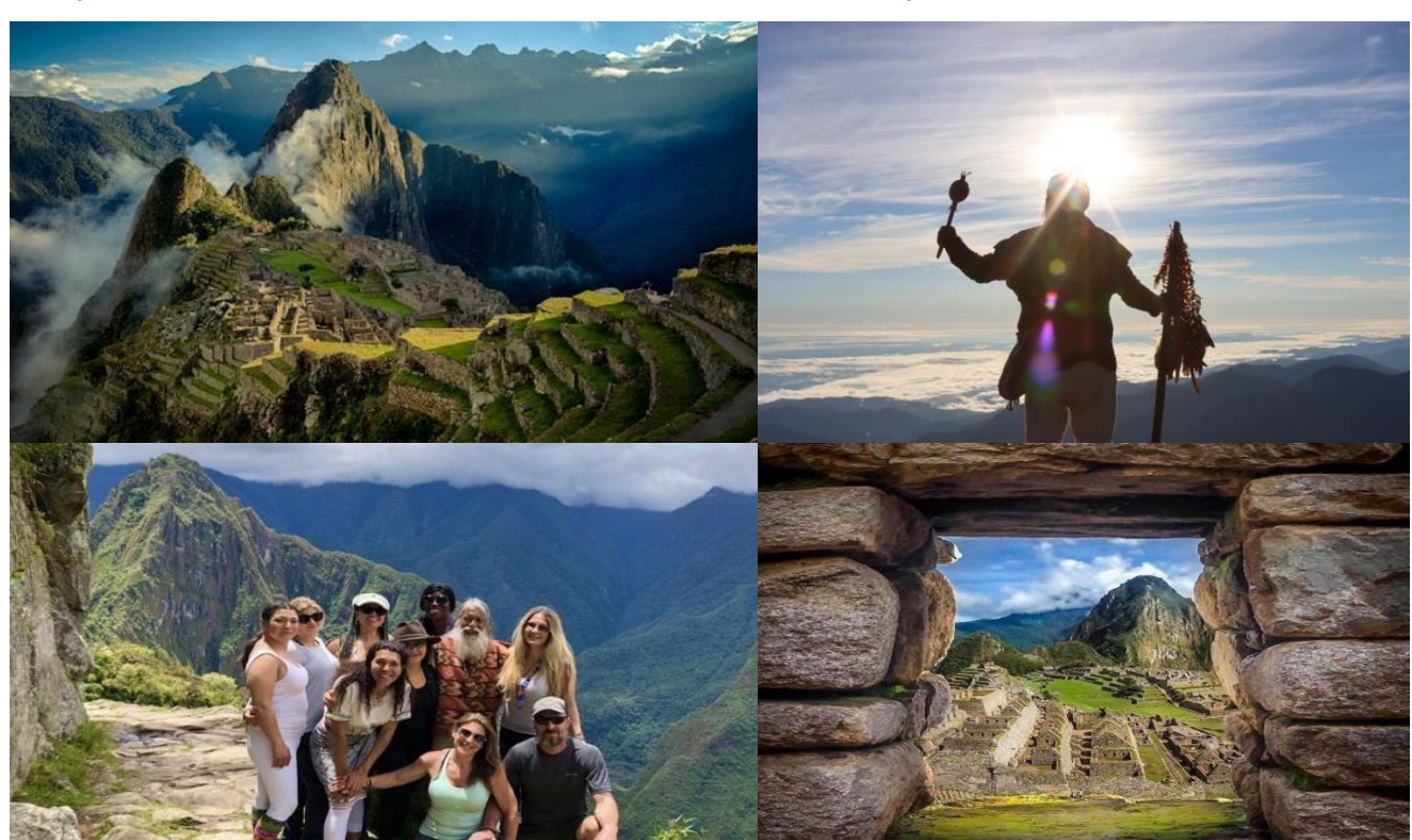
Day 4: Machu Picchu Sunrise and Plant Medicine Ceremony April 26th

Today, we will be rising early, will begin with a heart meditation, sun gazing and connection with the energy of this crystal city of light MachuPicchu. As the sun is rising, we are activating our heart chakra. We will then gather to prepare for the highlight of the day which will be our Plant Medicine Ceremony inside Machu Picchu, a very rare opportunity to sit in ceremony, to open our hearts and achieve the transformation we seek at this sacred site. During this special ceremony our Spiritual guide Wachan will guide us through Machu Picchu to show us the most important temples and altars of Machupicchu as we are also guided by Grandfather Wachuma through the land Of the Inkas to receive the messages of the ancient ones.