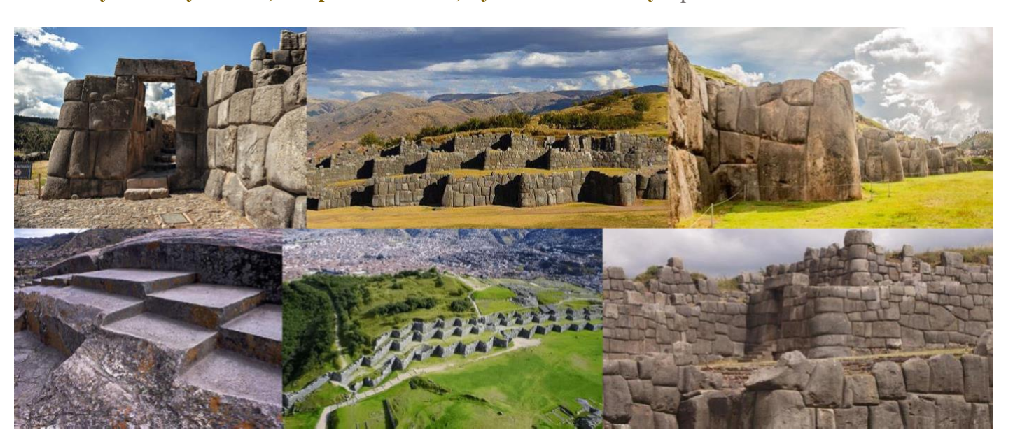
Day: 8 Sacsayhuaman, Temple of the Moon, Ayahuasca Ceremony April 30th

Today after breakfast we will be having more powerful ceremonies in this sacred temple Sacsayhuaman, which means "Decorated head of the Puma," a sacred Inca site. This fortress/temple complex was the ruling palace of the Inca where the living god directed his people. One of the most important religious centers of the Inka's considered the house of the Sun during the Inka's time. Here wewill have a chance cross the Pakarina (rebirth tunnel) which consist in an ancient cleansing. Sacsayhuaman is a perfect place for meditation and connecting our spirit with Mother Earth, closing a cycle, integration and cleansing. We will have a second stop at the Temple of the Moon, a hidden temple and vortex of healing.