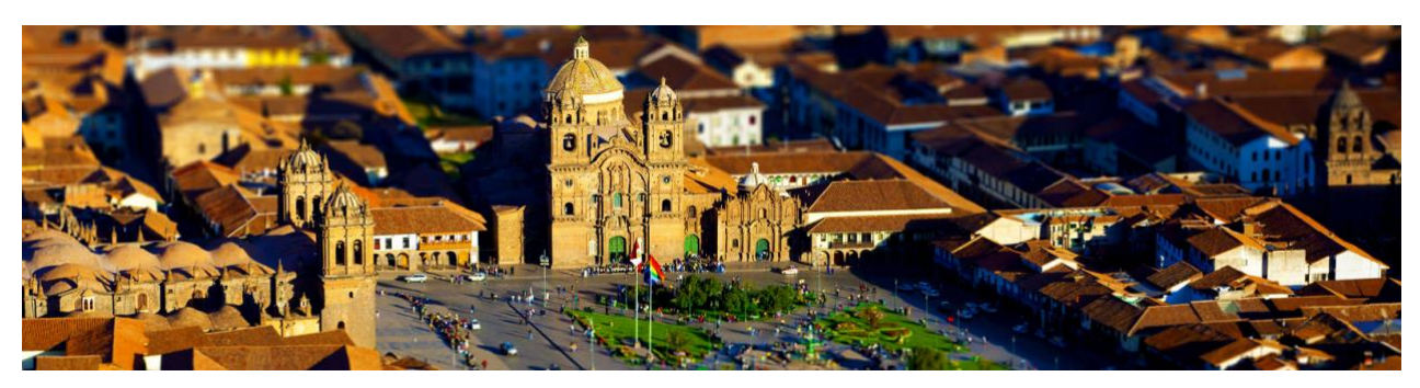
Day: 7 Free Day in Cusco April 29th